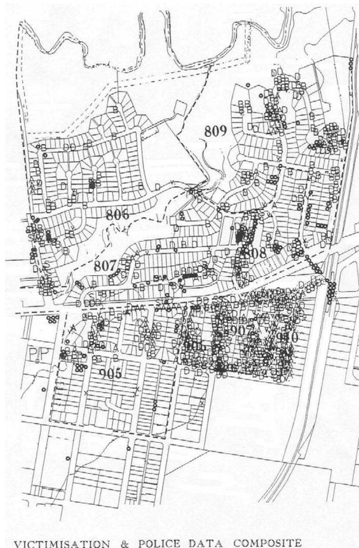
Fig. 2 Compilation of operational offences and reports of victimisation experiences

A recent study of the NSW metropolitan area by the NSW Bureau of Crime Statistics (Matka, 1997) contends that housing type (detached, semi-detached, walk-ups and high-rise) and even concentration of public housing are not the issues behind crime rates; rather, the link being with disadvantage/socio-economic factors. It is well recognised that the latter are always dominant, but the design of the built environment is also always a part of the behaviour-environment equation. There are several critiques which must be levelled at this work. The study reflects on recorded crime rates data at postcode (entire suburb) level, per 100,000 population. Consequently, relationships 'on the ground,' either in terms of public housing specifically or at street level generally, will remain elusive in reality.. Indeed, the author appreciates that the time-old concept of the 'ecological fallacy' seems is relevant here (see Barr and Pease, 1992, inter alia ) : ie statistics aggregated at meso-levels mask any significance analytic differences:... 'we should be careful about ascribing the characteristics of the postcode's population as a whole to any particular group of individuals within that postcode' (Matka 1997: 22). With the exception of 2 postcode areas, which have about 40% public housing dwellings, and a handful of others with relatively high proportions, the very