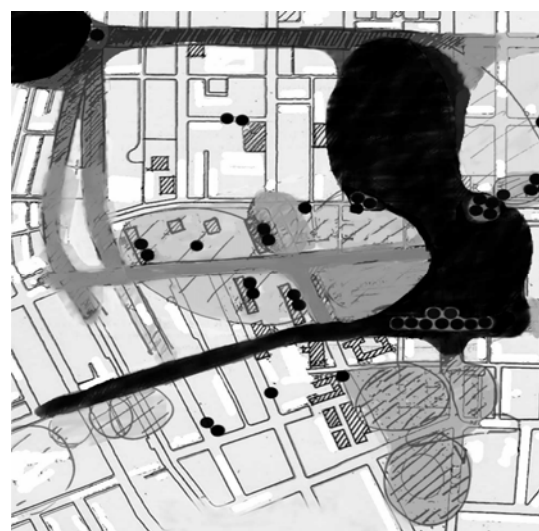
Fear and Victimisation, at night