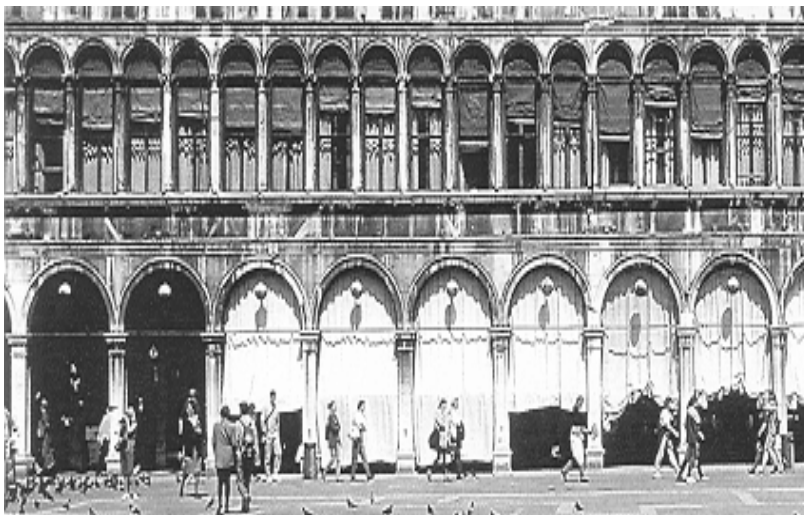
Venetian and North African shaded streets

...medieval townsmen, seeking protection against winter winds, avoided creating wind-tunnels (broad, straight streets). In the south, the narrow street with broad overhangs protected pedestrians against both rain and the sun's direct glare. Frequently the street would be edged by an arcade...giving [even] better shelter (Mumford, 1961/91)