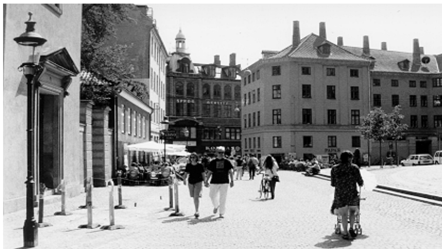
Copenhagen Urban Square: animation, visibility...human-scale

From yet another perspective, a mixed-use urban domain with a dense network of streets naturally populates an area, bringing 'eyes onto the street' (Jacobs, 1961), and results in heightened animation and surveillability opportunities, especially 'afterdark' (Samuels, forthcoming). Such an old city/new neighbourhood paradigm can naturally accommodate both the organic, narrow and curved street and sightline requirements for security via the integrated urban square which, in the jargon of situational deterrence, might be called a 'sightline node' - where movement paths intersect and lines-of-sight change direction (Samuels, 1995). If the 'space syntax' of such nodal points is convex in shape (Hillier & Hanson, 1984), anyone entering the area can see everyone else there.