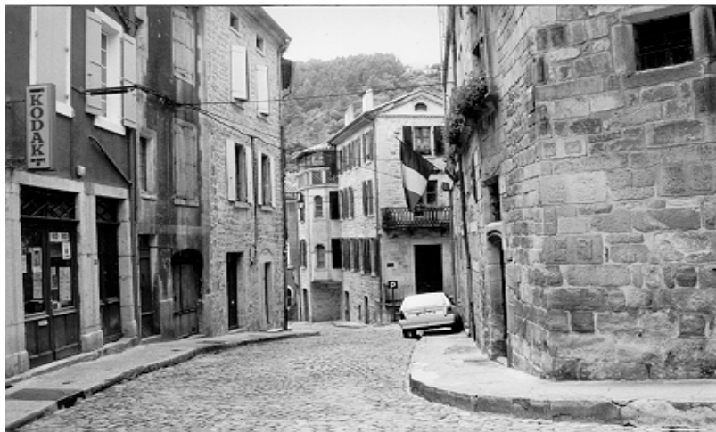
Largentiere, France: Car-rejecting old city/new neighbourhood

...it is better if the roads [in towns] are not straight, but meander gently - an ever-changing vista at every step, a view of the street for every house... (Alberti)