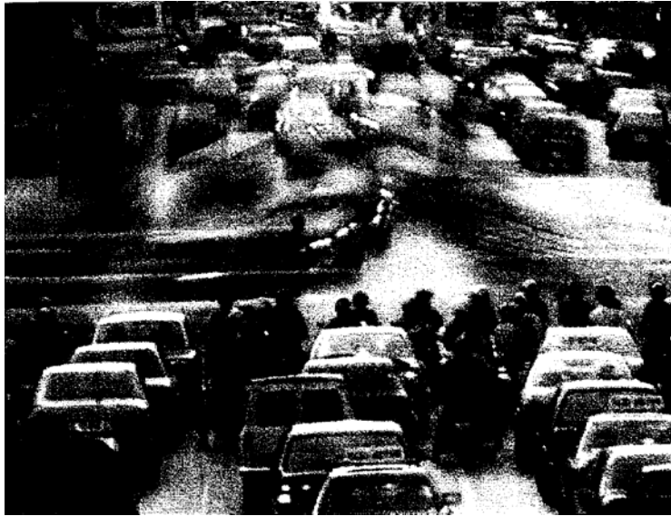
Bangkok, Thailand, 1997: we hold these truths to be self-evident?