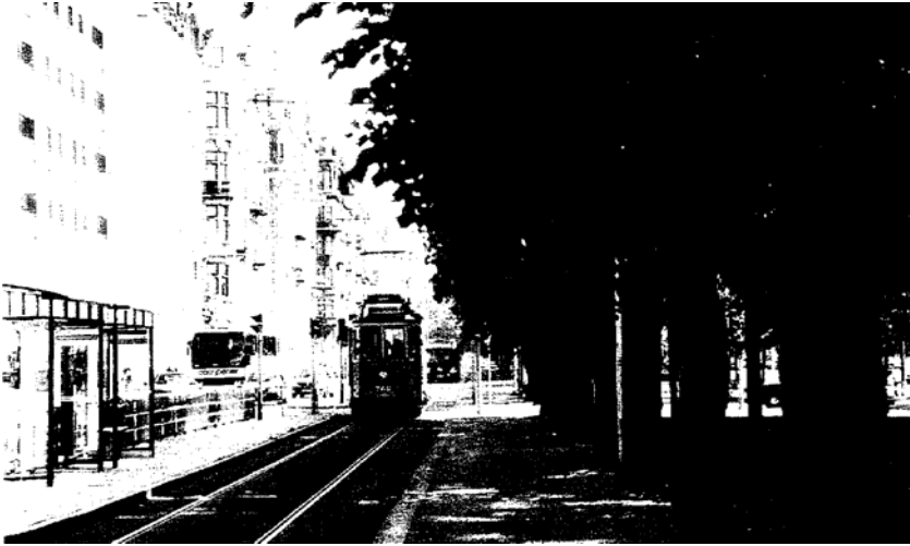
Stockholm, Sweden, 1997: Light-rail and shaded cycle-path integrated in urban domain