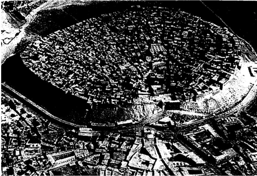
Erbil, Iraq (ancient Arbella, Mesopotamia): cellular urban morphology