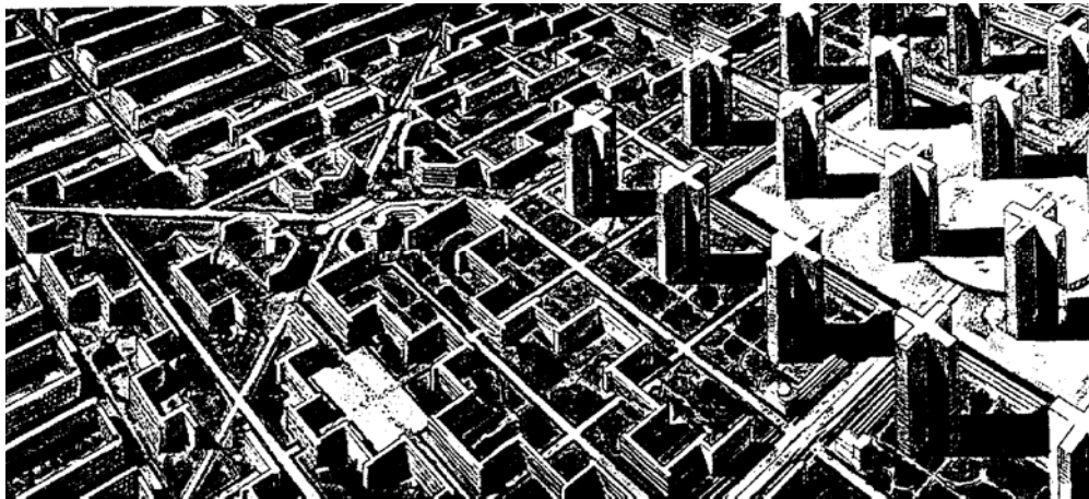
Corbusier's Contemporary City

The orthogonal grid favours the car, thus inadvertently encouraging the street to become the road (where the objective is to get somewhere not to experience the journey, or the place itself). Consequences (over and above GHG emissions) are air-pollution, noise-pollution and heat-pollution. The grid-iron inevitably leads to grid-lock. Corbusier (1924), the most misguided but unfortunately influential of urban planners, had the following to say: ‘a modern city lives by the straight line...the curve is ruinous...we must de-congest the centres of cities to provide for the demands of traffic...a city made for speed is made for success’.