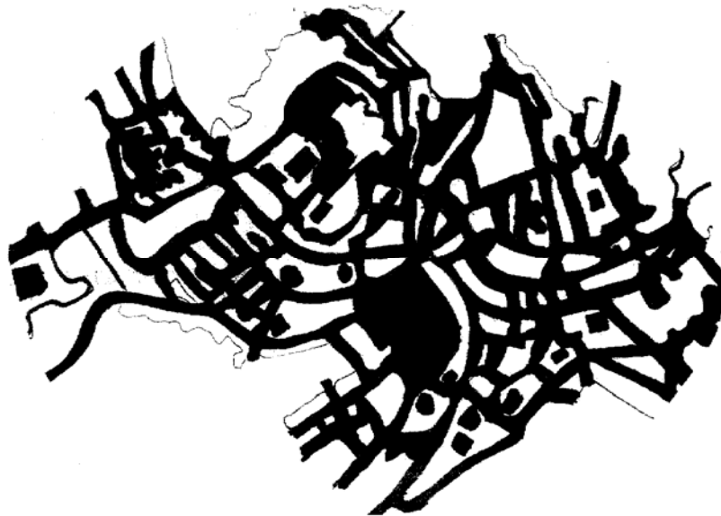
Siena, Italy: organic street geometry (line-drawing: author)